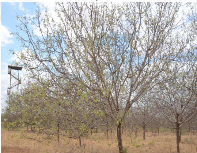
Melia orchard comprising genotypes of suitable mother trees is under trial for seed productivity in Kitui County

As part of the audit, the team visited Kitui County where for the past three decade, KEFRI and JICA have collaborated on forestry research, with JICA supporting key projects, including the development of improved dryland species including Melia volkensii , (Mukau). Mukau is a fast growing hardwood species native to dryland regions of Kitui, Makueni, Machakos, Embu and Tharaka Nithi. The tree which is drought-tolerant and termite-resistant, can be intercropped very well with other food crops.