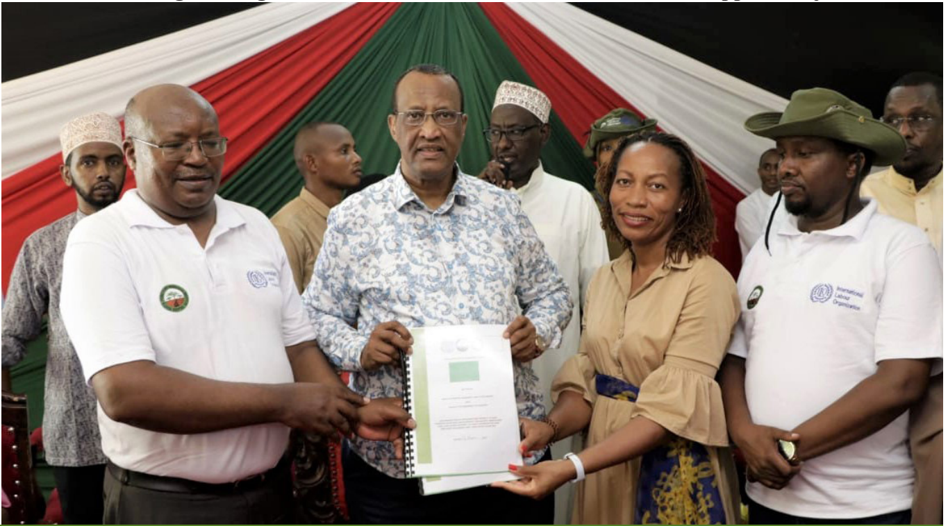
Garissa County Governor, International Labour Organization and KEFRI representatives sign Memorandum of Association

KEFRI in collaboration with the International Labour Organization (ILO), County Governments of Garissa and Tana River, Garissa University and Kenya Industrial Research and Development Institute (KIRDI) launched the Prosopis juliflora (Mathenge) Management for Decent Green Jobs & Livelihood Support Project in Garissa County on 19 th March, 2024.