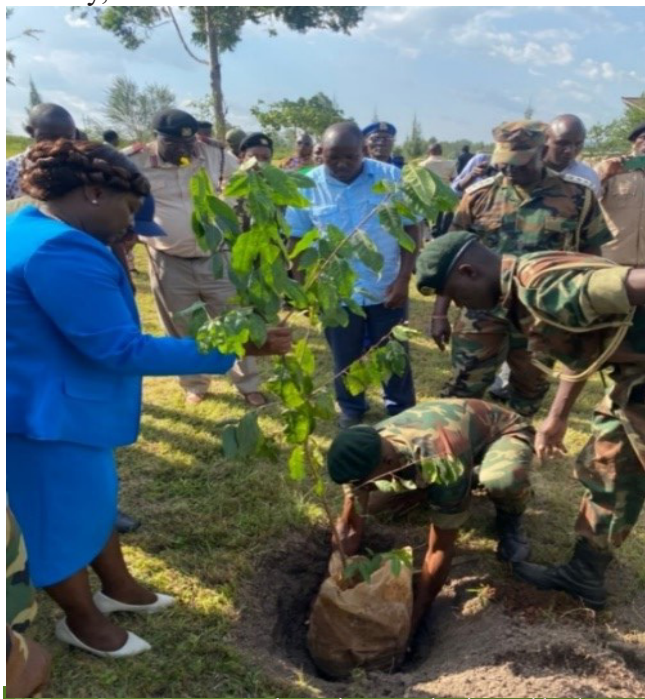
H.E Dr. Pastor Dorcas Gachagua in a tree planting and landscape restoration activity at Kendege Polytechnic, Migori County

Her Excellency Dr. Pastor Dorcas Gachagua joined KEFRI staff from Migori sub-centre in a tree planting and landscape restoration activity at Kendege Polytechnic, Migori County on 25 th January, 2024.