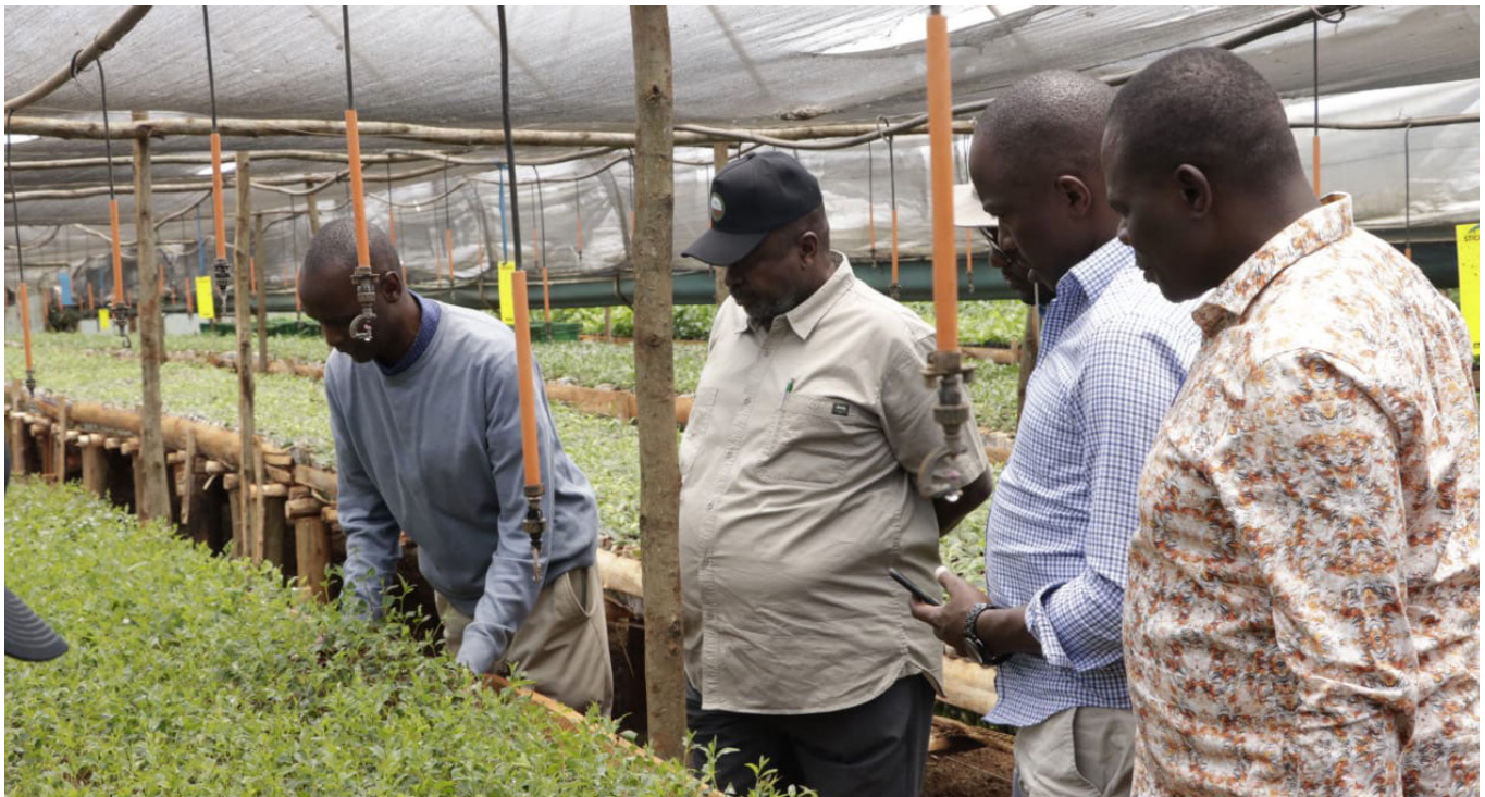
KEFRI Board of Directors visits Finlays greenhouse in Kericho County

The activity also extended to the Kamara establishment plot, providing a comprehensive overview of KEFRI's advancements in sustainable forestry practices.