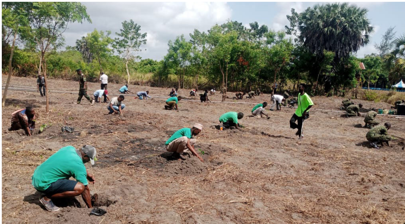
KEFRI staff from Lamu Sub-centre participates in tree planting at Hindi GK Prison to mark International Day of Forests 2024