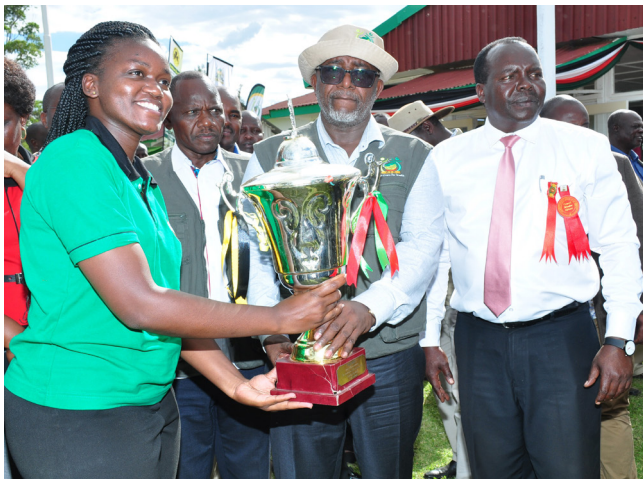
CS for Agriculture & Livestock Development Hon. Mithika Linturi (Centre) awards KEFRI a trophy for best performance

KEFRI is ISO 14001:2015 and 9001:2015 IMS certified and received an award in demonstrating the application of environmental quality standards.