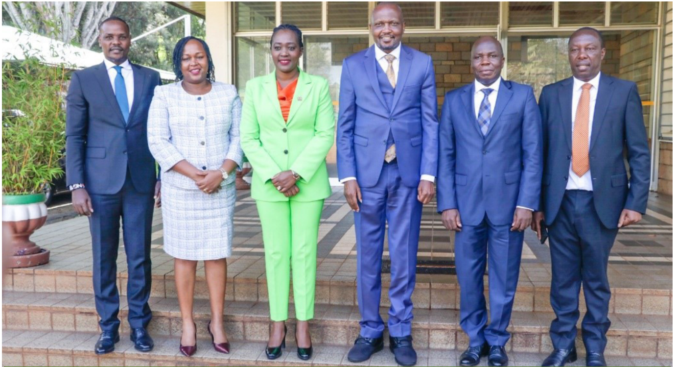
CSs and PSs visit during the Ministry of Environment, Climate Change and Forestry's presentation on GOK LAB report at KEFRI Hq