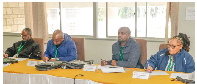
Delegation from Botswana Seed Centre attending training at KEFRI Headquarters

The knowledge acquired is expected to be instrumental in enhancing Botswana's forestry sector.