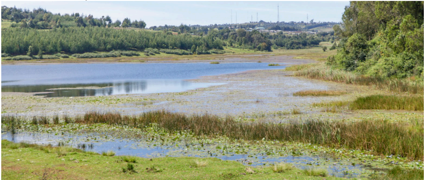
Lake Narasha Uasin Gishu County

KEFRI participated in the World Wetlands Day 2024's celebrations at Lake Narasha, Timboroa Dam in Uasin Gishu County.