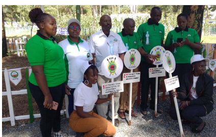
KEFRI staff celebrates awards received at Eldoret ASK Show